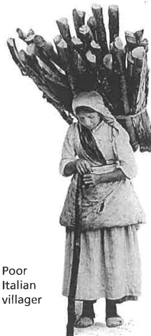
Poor Italian villager

In the late 1800s, a new wave of immigrants came to the United States for economic and political reasons.