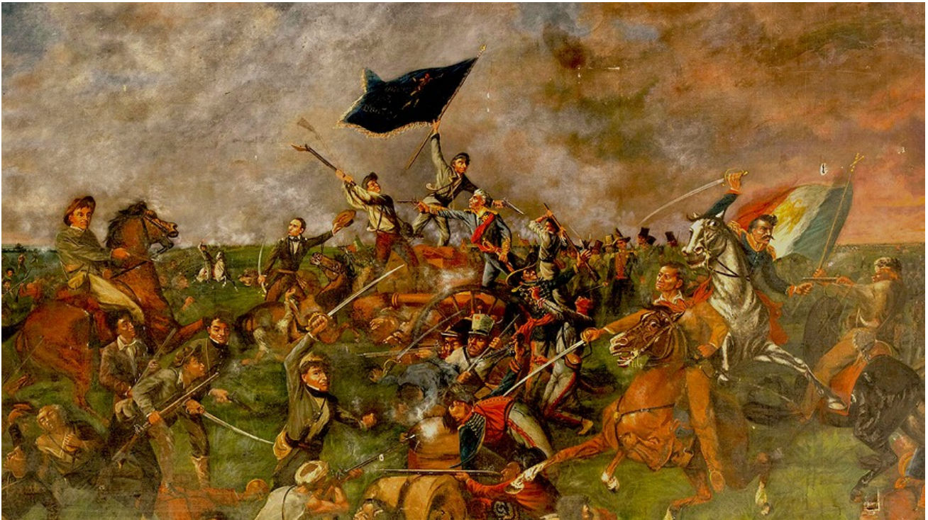
The Battle of San Jacinto, which saw the capture of Mexican President Santa Anna, paved the way for Texan independence from Mexico. Painting by Henry Arthur McArdle, 1901.