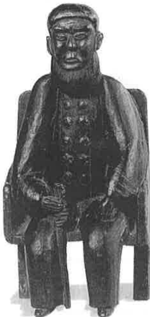
Japanese statuette of Commodore Perry

The United States opened trade with Japan and purchased Alaska from Russia.